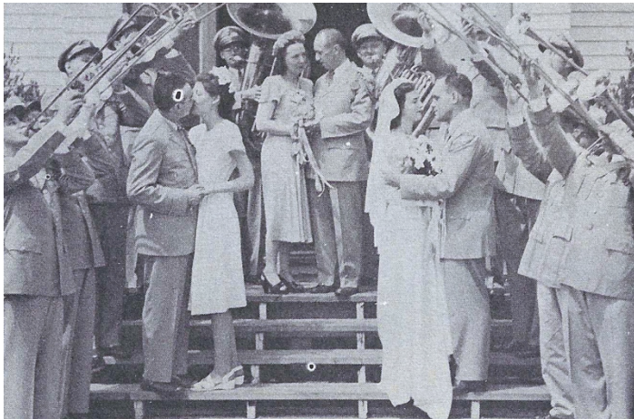
Triple wedding at Base Chapel