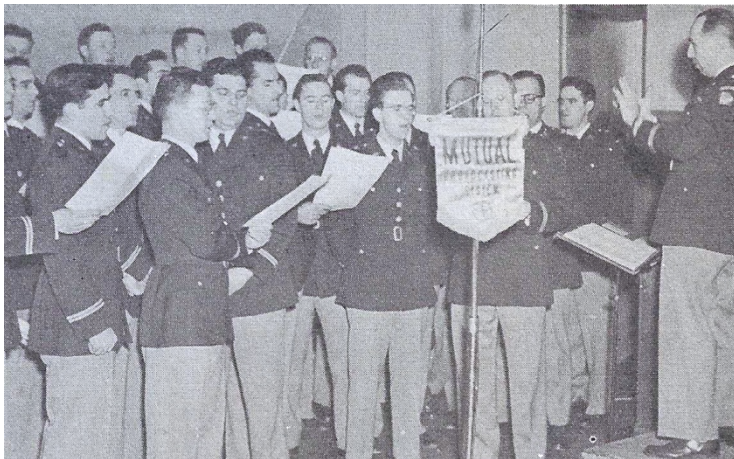
The Bolling Singing Sergeants